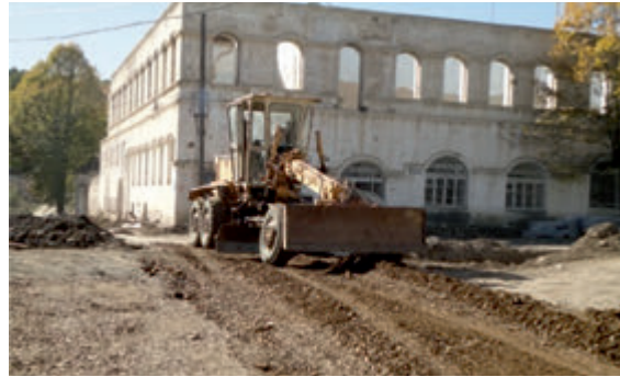
Hayastan All-Armenian Fund funded the reconstruction of the road infrastructure in the occupied town of Shusha | Photo from www.himnadram.org | August 2011

as of 2013. Thus, for example, while some 30 entities (27 legal persons, 3 individual entrepreneurs) were registered in the agricultural sector, 186 legal persons and 14 individual entrepreneurs were registered in the construction sector. 209 Furthermore, there were 334 entities (171 legal persons and 163 individual entrepreneurs) engaged in industry and 289 entities in total (53 and 236 respectively) engaged in transportation and communication development.