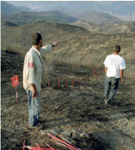
Halo Trust activities in the occupied Lachyn district

Most of the crops, wheat, barley and corn harvested in the occupied territories are transported to Armenia for domestic consumption and possibly for re-export. 407 According to Arthur Aghabekyan, so-called “deputy prime minister” of the separatist regime, in 2012 alone, some 20,000 tons of grain were transported to Armenia. 408 He also informed that the Armenians from Khankandi “obtained” land in the occupied Aghdam district and were cultivating it.