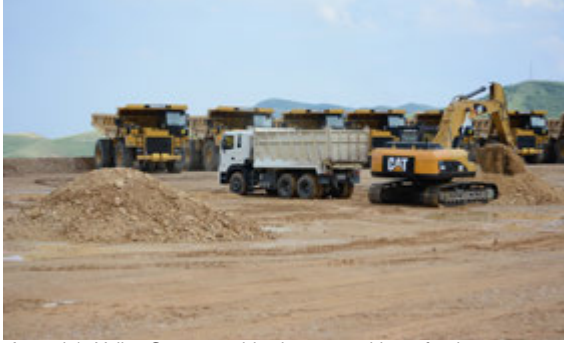
Armenia's Vallex Group provides heavy machinery for the exploitation of Demirli copper-molybdenum deposit in the occupied part of the Tartar district | Photo from www.bm.vallexgroup.am | 27 May 2014