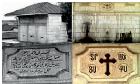
Mamayi spring in the town of Shusha before and after the occupation

Alleged “reconstruction” and “development” projects in Shusha and other towns and settlements throughout the occupied territories and “archaeological excavations” are carried out with the sole purpose of removing any signs of their Azerbaijani cultural and historical roots and substantiating the policy of territorial expansionism. Since the occupation of Shusha in May 1992, over 30 construction projects have been funded by Armenia and Armenian diaspora. As of 2014, a total of $11.5 million worth of infrastructural projects have been implemented in Shusha. 559 “Reconstruction” works also include the replacement of the Azerbaijani-Muslim elements of the monuments with alien ones, such as the Armenian cross and writings, which have been engraved on the Arabic character of the nineteenth century Mamayi spring in Shusha town.