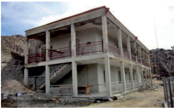
New residential building is built for the Syrian Armenians in the occupied town of Lachyn | Photo by Alvard Grigoryan | www.kavkaz-uzel.ru 12 February 2013

Syrian Armenians are among the beneficiaries of the programmes designed for the resettlement of the occupied territories. 168 Thus, in 2014, Tufenkian Foundation that implements several resettlement projects in the occupied territories organised fundraisings and provided the construction materials for finishing the renovation of the apartment buildings in the town of Zangilan and in Khanlyg village, specifically for Syrian Armenian settlers. 169 In fact, the first Armenian family from Syria arrived to the occupied territories of Azerbaijan much earlier, in 2008, before the crisis in Syria broke out, while the first Armenians from the Middle East, namely from Beirut, were resettled in Mashadiismailly village in the Zangilan district back in 1999. 170