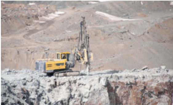
Exploitation of Soyudlu gold mine in the occupied Kalbajar district

A German company Freedom Resources is reportedly exploring ore field (precious metals, nonferrous metals and rare metals) in the occupied Kalbajar district, while another German company, Freedom Metals, is conducting exploration of mercury mine near Zulfugarly village in the occupied Kalbajar district. 468