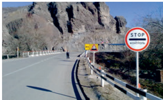
Armenia through its armed forces and subordinate regime controls access to the occupied territories. Above is a control point near Zabukh village in the occupied Lachyn district

Continued efforts are being made by Armenia towards incorporating the occupied territories into its socio-economic space and its customs territory, in violation of its international obligations, including those assumed within WTO. 32 The occupied territories of Azerbaijan are alleged by the Armenian side to be in a common customs zone with Armenia. Imports to these territories are regulated according to the Customs Code of the Republic of Armenia. 33 Azerbaijan's customs checkpoints along the occupied section of the international border between Armenia and Azerbaijan are destroyed. Despite Armenia's commitment not to extend the would-be trade preferentials to the occupied territories of Azerbaijan within the context of Armenia's accession to the Eurasian Economic Union (EEU), declarations by Armenian officials that no customs checkpoints will separate the occupied territories from Armenia testify to its attempts to incorporate those areas into its customs territory. 34 Prime Minister of Armenia, Hovik Abrahamyan, is quoted to have said that "Armenia will continue to form a single economic territory with Nagorno-Karabakh even after joining the Russian-led Customs Union. We will remain a single territory, and I believe there can be no other formulations on this issue." 35