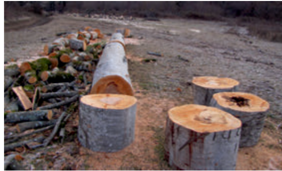
Unlawful timber cutting and exports of rare species of trees from the occupied territories of Azerbaijan is on the rise | Photo from www.hetq.am | 11 July 2012

In 1993 only, some 206,6 thousand cubic meters of valuable types of timber were taken to Armenia. In 1996, 55 ha of walnut trees of Leshkar forest area, planted in 1957-1958, were cut down. 538 The evidence confirms that cutting of walnut-trees, oak and other trees is continuing. Back in 2003, the Armenian sources reported that some 10,000 walnut trees were cut down in the occupied territories. 539 It is difficult to find out how many hectares of forest have been cut to date in reality. However, even the Armenian own sources confirm that illegal cutting of trees in the occupied territories and timber cutting is on the rise. 540 Thus, some 45,359 m 3 of timber was cut in 2010, while that volume increased to 96,237 in 2013. 541