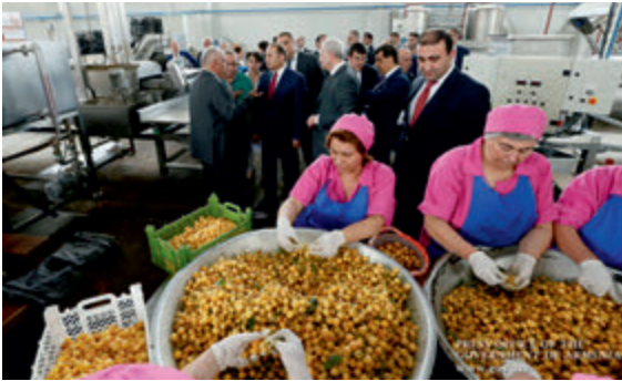
Armenia's Prime Minister Hovik Abrahamyan visits "Artsakh Fruit CJSC" company's facilities in the occupied territories of Azerbaijan | Photo from www.gov.am | 24 June 2014

specializes in exports of alcoholic beverage produced in the occupied territories. 291