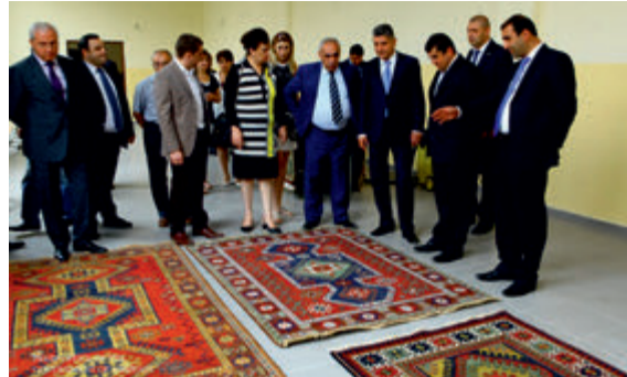
Former Prime Minister of Armenia, Tigran Sargsyan, visits "Karabakh Carpet LLC" production facility | 03 September 2013

Rugs produced by "Karabakh Carpet LLC" company in the occupied town of Khankandi are transported to Armenia and exported as Armenia's product. "Karabakh Carpet LLC" has production facilities in the occupied town of Shusha 317 , Lachyn, Jabrayil districts and Ghuneychartar village in the Khojavand district. 318 The company employs settlers, who moved to the occupied territories from Syria, Armenia, Georgia and Russia. The carpets produced in the factory are transported to the United States for sale. The company also has sales contracts with the firms in Austria, Italy, Egypt and other countries. 319