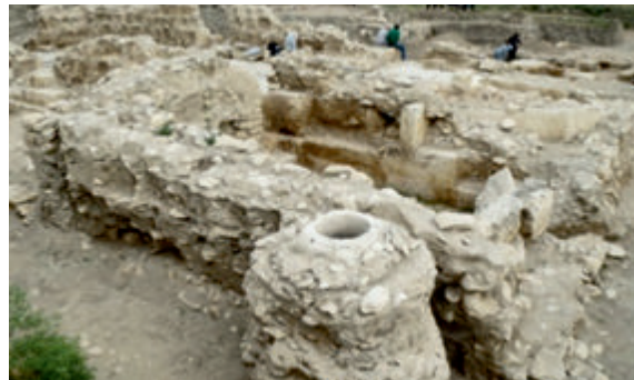
Illegal archaeological excavations in the vicinity of the occupied town of Aghdam

In the town of Shusha, the architectural monuments, such as the Yukhary and Ashaghy Govharagha mosques with their madrasahs, the mausoleum of Vagif, and the house of Natavan and caravanserais, have been destroyed, burnt and pillaged.