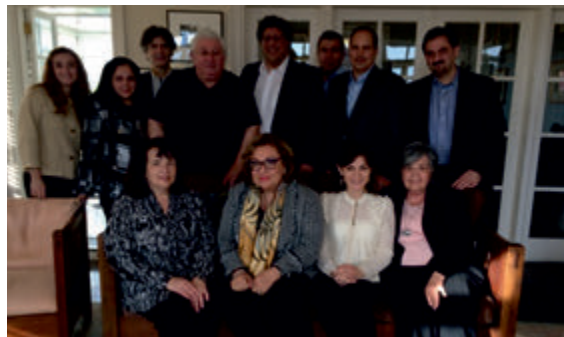
"Artsakh Fund" of the Armenian Cultural Association of America held a kick-off reception in New York (USA) in November 2014 to announce its expansion plans for "Arajamugh" settlement in the occupied Jabrayil district | | 01 December 2014

Actual spending of Armenia to sustain the subordinate separatist regime and the illegal activities in the occupied territories is considerably higher and includes the budgets of various ministries and approved joint action plans with the subordinate separatist regime to provide technical support and other expertise to implement projects in those territories. Armenia is also funding military training in Armenia and abroad for the servicemen of the armed formations of the subordinate separatist regime.