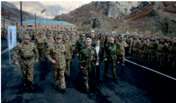
President of Armenia visits a military unit in the occupied territories | Photo from www.president.am | 16 November 2013

Thus, the high-ranking political and military officials, including the incumbent President of Armenia Serzh Sargsyan and the Minister of Defence of Armenia Seyran Ohanyan, who were commanders of the Armenian armed forces during the invasion of the territories of Azerbaijan in 1992-1994, on a number of occasions admitted the presence and involvement of the armed forces of Armenia in military operations both at a time of occupation of the territories and at present.