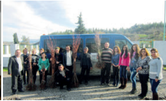
"Armenia Tree Project" provides fruit trees for the newly arrived Syrian Armenians settled in the occupied Lachyn district | 16 June 2015

As per other sources, as of 2015, the number of Armenian families from Syria settled in the occupied territories reportedly reached several hundreds. Given that, according to the Republic of Armenia's Ministry of Diaspora, more than 16,000 Syrian Armenians have entered Armenia since March 2011, and at least 11,000 continue to reside in Armenia, the number of those settled in the occupied territories is likely to be much higher. They were allotted with either newly built homes or apartments in renovated buildings. Those families deciding to stay and adapt are promised the property ownership certificate. Regardless of how many Syrian Armenians currently reside in the occupied territories, their presence in those territories serves as an incentive for more their compatriots and relatives to move from Syria and from Armenia, given the continuing instability in Syria and dire economic conditions in Armenia. 176