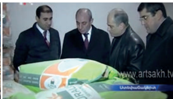
"Euralis" and other seeds used to grow settlement produce in the occupied territories are provided by Armenia | Video footage from www.artsakh.tv