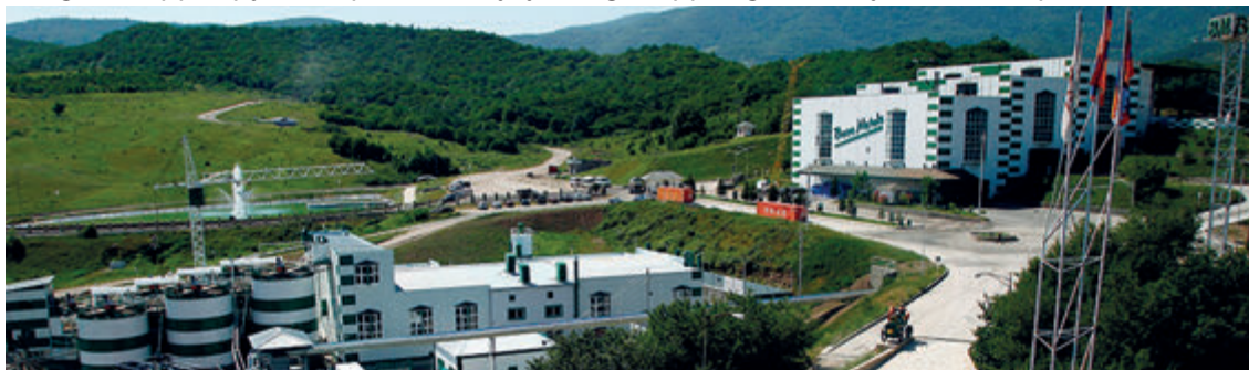
Armenia's Vallex Group through its Base Metals subsidiary exploits Gyzybulag underground gold and copper mine near Heyvaly village in the occupied Kalbajar district | Photo from www.bm.am | 12 June 2012

The occupied territories of Azerbaijan are rich in natural resources. There are around 155 deposits of precious stones, minerals and base metals, including deposits of non-ferrous metal ores, gold, mercury, copper, lead and zinc, pearlite and other natural resources. 414 Among them are gold-copper-pyrite deposits in Gyzybulag, copper-gold, molybdenum deposits in Demirli,