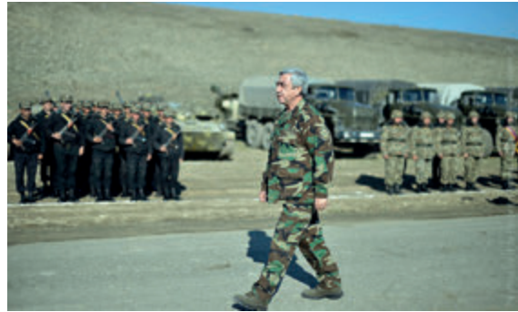
President of Armenia Serzh Sargsyan attends the military exercises in the occupied territories | Photo from www.president.am | 19 November 2015

Office of the Bureau of Criminal Investigation of Armenia initiates criminal cases concerning the death of Armenian soldiers killed in action or in non-combat circumstances in the occupied territories in accordance with the Criminal Code of the Republic of Armenia. 27 The Committee dealing with Armenian prisoners of war and missing persons chaired by the Minister of Defence S. Ohanyan is in charge of repatriation of Armenian prisoners of war. 28