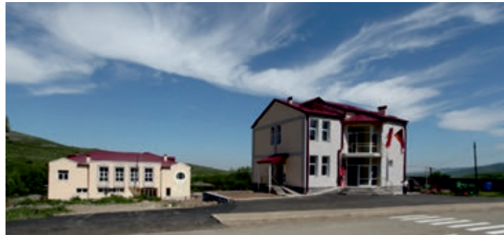
Community centre in Zogalbulag village in the occupied Khojavand district | 27 May 2013