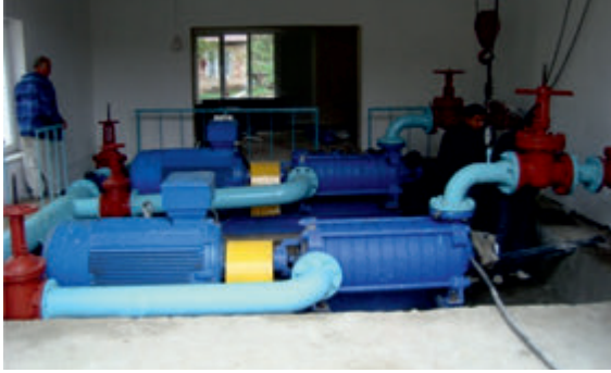
Hayastan All Armenian Fund funded the reconstruction of the water supply system in the occupied town of Lachyn | June 2011

Given the highly subsidized nature of agriculture in the occupied territories, 373 intensive agricultural production in those territories is heavily dependent on financial assistance and the development of water, power and transport infrastructure. To service the settlements and farming, in particular those in the Araz Valley, with the support of Armenia, about 30 km of power lines were built, pumping stations were installed, artesian water wells and roads were constructed. 374