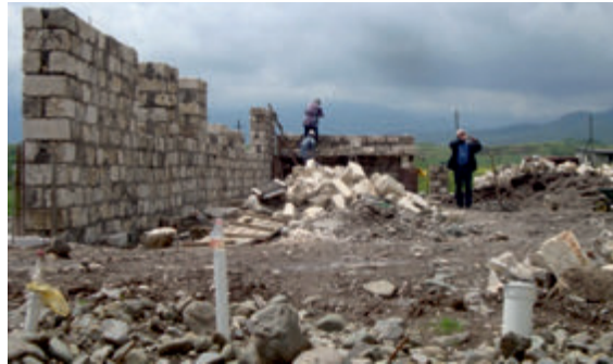
Hayastan All-Armenian Fund's Toronto (Canada) affiliate sponsors construction of a community centre in the occupied town of Khojaly | | 15 May 2015

the country's president." 44 Armenians from Armenia and those residing in the occupied territories amount to around 40 percent of all the benefactors of the Fund. The method of mandatory donation has been widely exercised to collect money from the public employees in Armenia. The authorities are reportedly forcing people to donate money or arbitrarily deduct donations from the salaries of the employees. 45 Such a method of collecting financial resources for the Fund is believed to be nothing other than an attempt to whitewash corrupt practices in the Fund by showing to the diaspora its "popularity" within Armenia and thus encouraging more donations from abroad (see below). 46