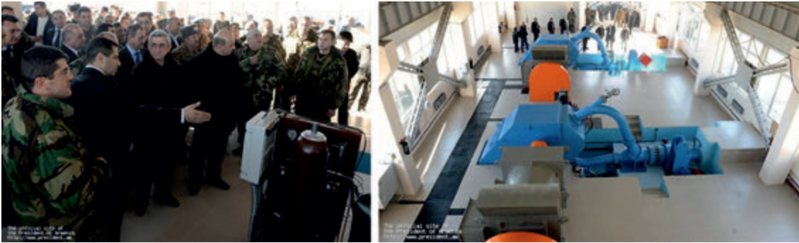
President of Armenia visits "Trghi-2" hydro power plant in the occupied Kalbajar district | Photo from www.president.am | 05 January 2012