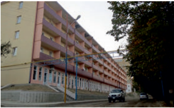
Newly reconstructed building in the occupied town of Shusha | Photo by Alvard Grigoryan | www.kavkaz-uzel.ru | 03 September 2014

The construction in 2015 of the healthcare facility for around 150 settlers who moved from Armenia to villages of Gushchu, Ashaghi Farajan and Safiyan in the occupied Lachyn district 210 is directly linked to promoting resettlement of a new population in that area. 211 Like many other facilities, the clinic is built on the ruins of demolished buildings, confirming the earlier reports that empty houses of Azerbaijani displaced persons are being dismantled for use as construction materials or that new houses are being built on their lands and properties. In 2013, construction of a kindergarten in the occupied town of Kalbajar and repair works in a hospital in the occupied town of Zangilan were launched. 212