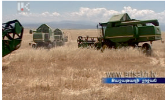
Crop harvesting in the occupied Zangilan district | “ArtsakhTV” footage | www.artsakhtv.am | 20 June 2012

The exploitation of the occupied Zangilan and Jabrayil districts along the Araz River is given a particular importance due to their agricultural potential, climate, water and other resources and is referred to by Armenian sources as “Armenia’s second Ararat plain”. 332 Armenian sources confirm that agricultural programmes for the “southern part of the Hadrut region” (i.e. the occupied Jabrayil and part of the Fuzuli districts) are much more comprehensive. 333