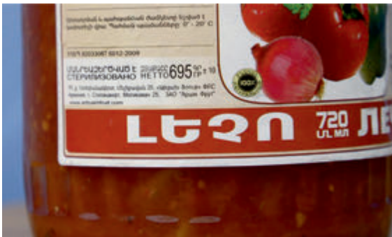
A label on the “Artsakh Fruit CJSC” product reads “Stepanakert, Armenia” | | 23 July 2014