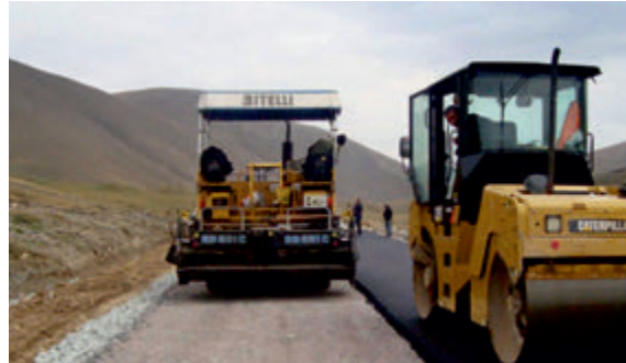
Construction works at the Vardenis-Aghdara highway passing through the occupied Kalbajar district of Azerbaijan | 10 November 2014

In 2008, Armenia launched reconstruction of the airport near the occupied town of Khojaly of Azerbaijan and manifested its intention to operate flights, including military ones, into/from the occupied territories. 204 Germany-based "Thales Air Systems GMBH" affiliate of the "Thales Group" (France) provided navigation equipment for this airport. A businessman from Argentina of Armenian origin, Eduardo Eurnekyan, purchased an aircraft to perform flights to the occupied territories. 205 Azerbaijan informed the international community that this airport, referred to by Armenia as "Stepanakert airport", is not an approved aerodrome under the legislation of Azerbaijan, nor is it a designated customs airport in accordance with the Convention on International Civil Aviation. 206 Consequently, all flights operated from and into that airport are unlawful and violate the said Convention and the fundamental principles and objectives of the International Civil Aviation Organization (ICAO). Since Azerbaijan, acting in the exercise of its sovereign right, has closed the airspace over the occupied territory for any aviation operations, no flight into or from this airport is authorised. ICAO, through its Secretary General confirmed the inadmissibility of unauthorised flights over the territory of Azerbaijan recognised by the United Nations. 207