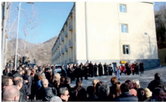
Commissioning of a newly constructed residential building in the occupied town of Lachyn

An extensive network of irrigation systems and water supply pipes is being built to service the settlements and illegal activities, especially in the agricultural sector, throughout the occupied territories (see below).