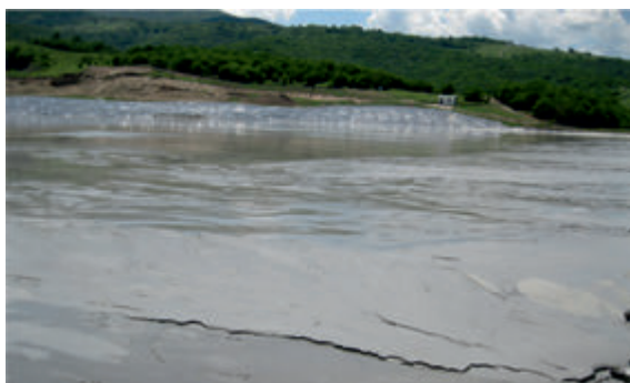
Depredatory exploitation of Gyzybulag mine in the occupied Kalbajar district produces millions tons of waste in tailing dumps, which are saturated with heavy metals and other dangerous substances

The exploitation of the natural resources accompanied by associated ecological disasters, such as tailing dumps and water pollution, has reached such a fast and unobstructed pace that even Armenia-based environmental organizations, including the Pan-Armenian Environmental Front (PAEF), raised red flag. 549