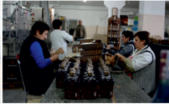
Production facility of the "Stepanakert Brandy Factory CJSC" | 10 December 2014

(Estonia), "Artsakh-Italy OJSC" (Italy), Yerevan-registered SAS online supermarket and Yerevan City supermarket chain of Armenia.