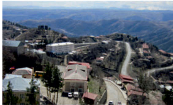
The occupied town of Lachyn is one of the primary targets for the settlement activities

Settlement activities in the occupied territories are carried out in a pre-planned and organized manner with clearly defined objective and geographic focus. 117 According to so-called “deputy prime minister” of the subordinate separatist regime, Artur Agabekyan, “[s]ettlement programs is a priority for the NKR Government”. 118 He confirmed that residents from Armenia are brought to settle in the occupied territories, calling this process not a “repopulation”, “but just a settlement”. 119 Armenia, in particular through its Ministry of Diaspora 120 and other State organs, political structures, charity organizations and the subordinate separatist regime in the occupied territories, is directly involved in the settlement activities. Armenia-controlled Hayastan All-Armenian Fund designed a special “Re-population of the villages of Artsakh” project.