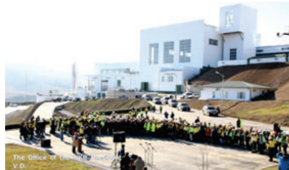
Commissioning of the ore processing plant at Demirli mine | | 26 December 2015

The Vallex Group CJSC has invested some $130 million in exploitation of the mine that became operational in 2015, 441 i.e. at a time of anticipated depletion of Gyzybulag mine. 442 The company employs some 1,400 workers, including mining engineers from Armenia, Russia, Republic of South Africa and elsewhere. 443 At least one of the reported source of the investment for this project is VTB Bank (France) SA and VTB Bank (Armenia), which are part of Russia-based VTB Group. According to Base Metals CJSC Financial Statements for 2013, in 2011 a loan agreement for $25 million and in 2013, a loan agreement for $11 million was signed respectively with VTB Bank (France) SA and VTB Bank (Armenia). 444 According to the programme, about 17 million tons of ore will be processed in this mine during the coming 10 years. 445 Armenia supplies energy to the exploitation of the mine through “Sotk-Karvachar-Aterk” high-voltage power grid, which was built specifically for this purpose. 446 In March 2012, Bako Sahakyan held a meeting on issues related to the exploitation of that mine. He underlined the serious expectations from the exploitation of the ore deposit. 447