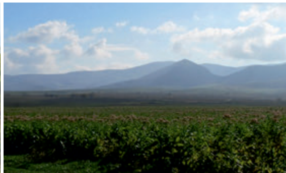
Tobacco plantations in the occupied territories of Azerbaijan | 23 November 2014