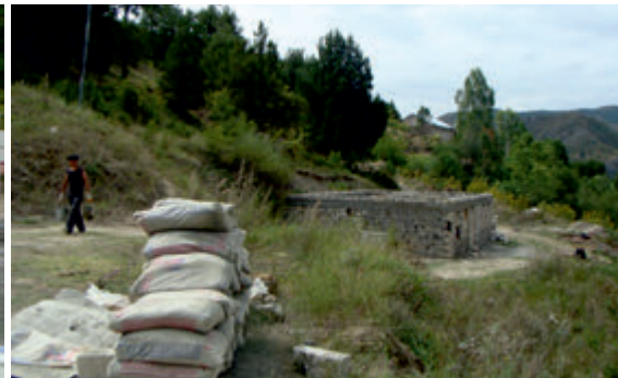
Construction of houses for the Syrian Armenian families settled in the occupied town of Lachyn | 02 September 2013