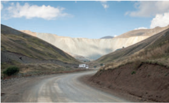
Unprocessed ore from Soyudlu gold mine in the occupied Kalbajar district is transported to Armenia via Zod pass | Photo by Andrey Kolchugin | www.panoramio.com | 20 September 2012