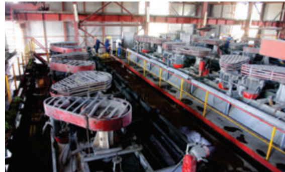
Ore processing plant at the Gyzybulag underground mine near Heyvaly village in the occupied Kalbajar district