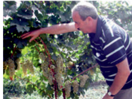
Tufenkian Foundation funded reviving of the thirty-five hectares of abandoned grape vineyards in the Ishygly village in the occupied Gubadly district | Photo from www.Hetq.am | 09 October 2006

According to the Armenian statistics for 2013, of total sown area of 63,319 hectares, around 93 percent (58,687 ha) was sown with grain. 350 More than one third of that cultivated area is in the occupied Lachyn, Jabrayil and Zangilan districts. If in 2009 grain sowing was carried out on 10,673 hectares in the “Kashatagh region”, 351 by 2013 that figure doubled. According to the so-called “deputy head of Kashatagh administration”, Artush Mkhitarian, in 2013, there was 20,000 ha of wheat sown area in “Kashatagh”, which constitutes around 34 percent of total sown area in the occupied territories. 352 He also said that the wheat sown area in “Kashatagh” is very important in respect of food security of Armenia and “Artsakh”. 353