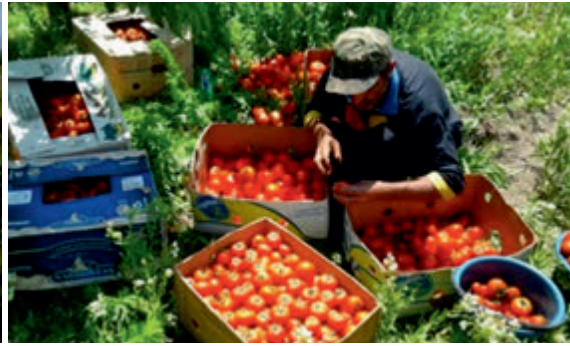
Greenhouse cultivation by the settlers of Alibayli village in the occupied Zangilan district

the mining sector and the relatively beneficial conditions that exist for growth in the agricultural sector. He also informed of the plans to build three more hydro-electric plants in addition for the two already in operation. 347