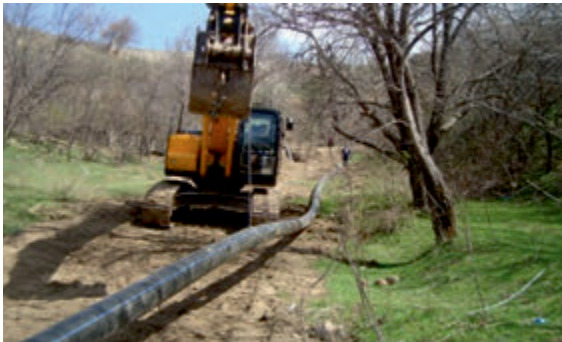
Second phase of the construction of the water supply system in the occupied town of Lachyn | Photo from www.himnadram.org | April 2013

Of particular concern is the exploitation of water resources. Armenia's occupation of the territories of Azerbaijan allowed it to capture and divert waters of the Araz River and other rivers and their headwaters, and construct artesian wells, pump-stations and irrigation canals for the settlements' use in the Araz Valley and elsewhere or to use their hydropower. 375 According to the Armenian statistics, as of 2013, of total 592,9 thousands hectares of agricultural lands, only 23,3 percent (138,41 thousands ha) were arable. 376 That makes access to and control of water resources, in particular in the occupied Kalbajar, Lachyn, Zangilan and Jabrayil districts, an important factor in the colonial enterprise of Armenia. 377 According to the so-called "spokesperson" of the separatist regime David Babayan, "[...] Nagorny Karabakh is in a position to almost entirely provide for its own environmental security and its water resources, and in this context the Karvachar region [Kalbajar] plays a key role... Therefore, if we lose this region the water security of Karabakh would be under serious threat." 378 In his recent interview, Babayan asserted that "imagine that the enemy again establishes control over Karvachar where our rivers head – rivers such as Arpa and Vorotan that flow into Lake Sevan making up 80 percent of Armenia's water resources." 379 Faced with water deficiency of the recent years and associated decline in hydro-power generation capacities, 380