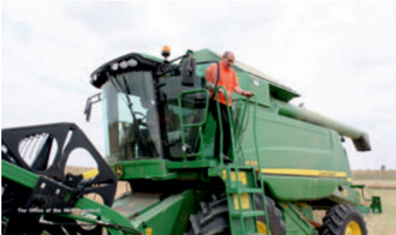
US-manufactured John Deere agricultural equipment is used for exploitation of agricultural resources of the occupied territories 03 July 2011