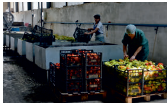
"Artsakh Fruit CJSC" production facility in the occupied territories of Azerbaijan | Photo from www.hetq.am | 27 August 2014

The Government of Armenia is supporting and encouraging production and export of the products unlawfully produced in the occupied territories. In August 2014, President Serzh Sargsyan of Armenia visited Tagavard village in the occupied Khojavand district and got acquainted there with the work of vegetable oil producing plant. 299 In January 2012, he visited the wood processing enterprise and a pellet producing unit in Chanagchy village of the occupied Khojaly district. 300