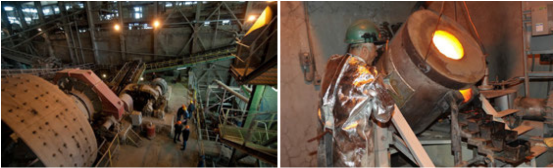
Ore from Soyudlu gold mine is processed at Ararat Gold Processing Plant in Armenia