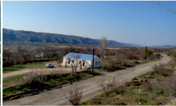
Two-apartment building for two Syrian Armenian families is built in Khanlyg village of the occupied Gubadly district by Tufenkian Foundation 25 March 2014