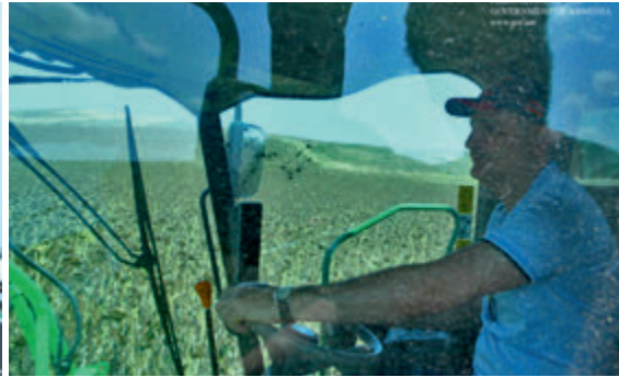
Former Prime Minister Tigran Sargsyan of Armenia drives combine in the sunflower plantation in the occupied territories | 03 September 2013

and Jabrayil districts, expecting that land cultivation, including crops and other vegetable growing and agricultural exports, will generate sufficient revenue for the settlers to stay and expand their communities. 356