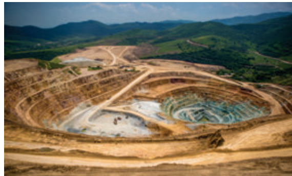
Exploitation of the Demirli mine in the occupied part of the Tartar district

In March 2012, Base Metals CJSC unlawfully acquired “license” for 25 years for exploitation of Demirli open-pit copper and molybdenum mine (referred to by Armenia as “Kashen”), which is located some 15 kilometres east of Gyzybulag mine and includes the area of Demirli, Gulyatagh and Janyatagh villages in the occupied part of the Tartar district. 435 The mine contains around 55-56 million tons of proven ore reserves. 436 As of October 2013, some 1700-2000 tons of ore were transported to the plant near Heyvaly village for processing on a daily basis. 437 In order to process it in place, 438