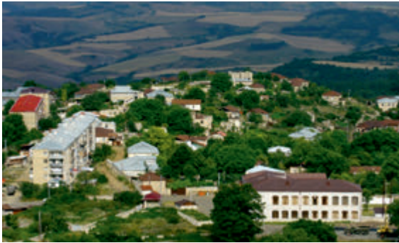
Newly constructed/renovated buildings and houses in the occupied town of Shusha | 21 August 2013