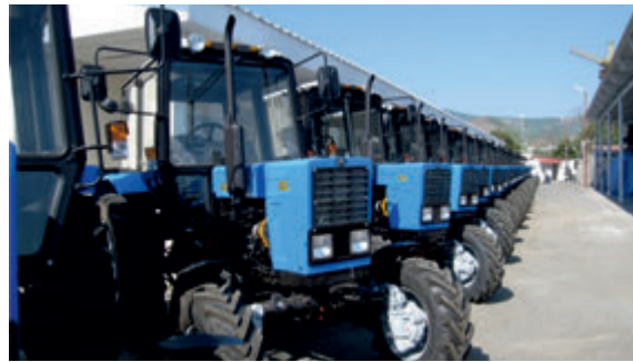
Belarus-manufactured wheeled tractors MT3-82,3 used in the occupied territories | | 19 January 2015