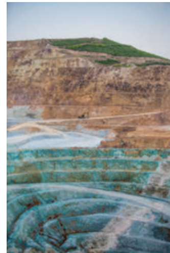
Exploitation of Demirli copper-molybdenum deposit in the occupied part of the Tartar district 27 May 2014

“[...] [t]he Presidents of Armenia and Karabakh visited also the Maghavuz coal mine in Martakert region which has already started to deliver black coal to the Republic of Armenia for the Yerevan Hydro-Power Station, Ltd., which produces electricity in the mixed water-coal regime (through the refurbishment and commissioning of the old power generating units). This investment project, which is important for the energy and mining areas, along with fostering economy will also considerably enhance Armenia’s energy security. The Presidents of Armenia and Nagorno Karabakh were informed that a coal-preparation plant will be constructed on the territory of the Maghavuz mine. After familiarizing with the ongoing works and prospective programs of the mine developing company, Presidents Sargsyan and Sahakian wished the company all the best in its future activities.” 484