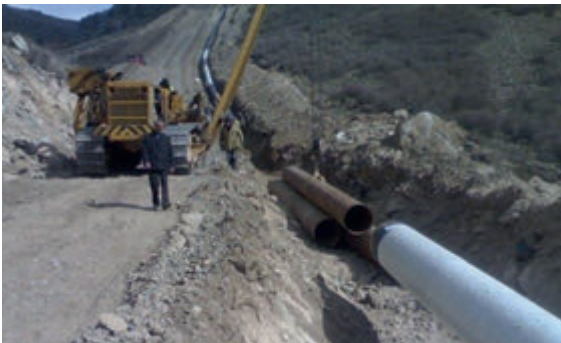
Armenia’s Dorozhnik LLC company built transmission pipeline for water flow of Toraghaychay River in the occupied Kalbajar district into the Sarsang reservoir

Armenia’s ArmWaterProject Company Ltd. directly participates in appropriation of the water resources from the occupied territories and is involved in rehabilitation and construction of the irrigation system in those territories. 383 ArmWaterProject and Cornerstone companies completely re-built 30-km-long canal to bring water to the arable lands in the occupied Jabrayil district. 384 The canal has capacity to drive up to 8 cubic meters of water per second and is capable of providing gravity-flow irrigation for around 5 thousand hectares, which can reach 8-9 thousand hectares