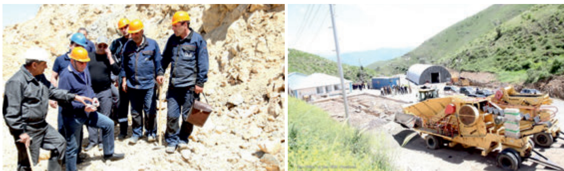
Exploitation of the gold mine near Vejnali village in the occupied Zangilan district | 15 May 2013

Aurubis AG (Germany), Zeppelin Baumaschinen GmbH (Germany), through its affiliate Zeppelin Armenia LLC, Strathcona Mineral Services Ltd. (Canada), Atlas Copco (Sweden), Tamrock (Finland), MoAZ (Belarus) and other entities, which are partners of the Vallex Group CJSC, are reportedly providing mining equipment and services for the exploitation of mineral deposits in the occupied territories. 448 Armenia's Armenian Copper Programme CJSC, Mining and Metallurgy Institute CJSC, Flesh Ltd. and Mika Cement CJSC are involved into these activities as well. 449