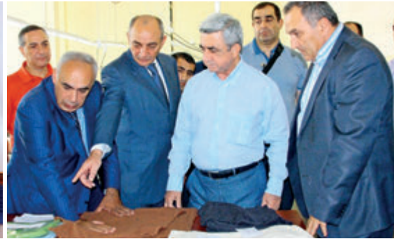
President of Armenia visits "Stepanakert Silk plant Co Ltd" in the occupied territories | | 01 September 2014