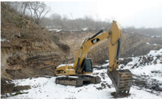
Coal mine near Chardagly village in the occupied Tartar district | 05 January 2012

The new road will also be used to transport coal from the coal mine near Chardagly village in the occupied part of the Tartar district. 480 Since 2013 the coal extracted at that mine has been reportedly transported by Armenia-registered cargo company Hana-Trans LLC via alternative routes to the thermal power plant in Yerevan, which consumes 2,000 tons of coal daily. 481 The coal is brought by trucks to Vardenis (Armenia) railway station and from there to Yerevan by railway. Armenia-registered Energy Plus Ltd. company has been granted by the Government of Armenia a three-year VAT payment deferment to develop this mine. 482 The coal supplies enable operation of two units of the Yerevan power plant with 50 MW capacity each. The energy produced in the plant is for both domestic use in Armenia and for export. The close supervision of that coal mine development by the President of Armenia, who frequently visits the mine (he