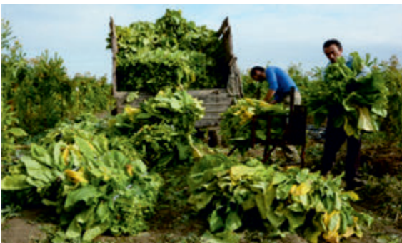
Armenia's "Grand Holding Inc." cultivates tobacco in the occupied territories, including in the occupied part of the Aghdam district | 25 November 2014