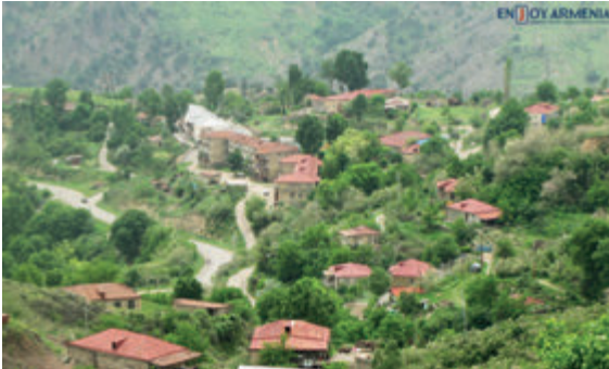
Newly constructed/renovated houses in the occupied town of Lachyn

A. Agabekyan alleged that limited resources prevent carrying out a wide-scale resettlement. According to him, there are villages with 50 residents, which are a heavy burden, and it is not economically feasible to carry out “social programs” there. On the contrary, he continued, there are many villages in “Kashatagh” 121 , “Hadrut” 122 , “Karvachar” 123 , where the number of residents reaches 1,000 and resettlement in those villages is justified. 124 Settlement activities and building permanent social and economic infrastructure in support of illegal settlement enterprise is carried out in pre-identified village clusters comprising of several villages in the so-called “strategic areas”, including those depopulated