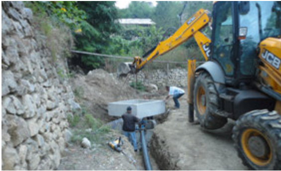
Construction of water supply system in the occupied Shusha district | Photo from www.himnadram.org | 2013