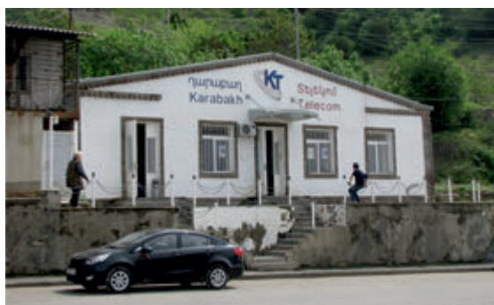
“Karabakh Telecom CJSC” branch in the occupied town of Lachyn | 15 May 2014

Armenia illegally assigns its unique numbering code +374 to the occupied territories, exploits Azerbaijan’s fixed and cellular radio-telecommunication networks and radio frequencies. Furthermore, contrary to Recommendation E.212 of the International Telecommunication Union (ITU), which provides the authority to ITU to assign and reclaim MCC and MNC codes, “Karabakh Telecom CJSC” uses 283 (MCC) and 04 (MNC) codes for the occupied territories of Azerbaijan. In September 2013, “Karabakh Telecom CJSC” extended its network to the occupied Zangilan district. 84