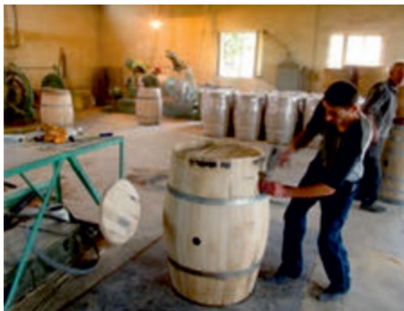
"Varanda CJSC" wood processing factory produces barrels from oak trees cut in the occupied territories 03 April 2012