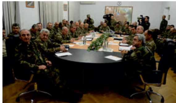
President and Minister of Defence of Armenia routinely participate in the military planning exercises in the occupied territories | Photo from www.president.am | 16 November 2013

The close, almost umbilical, links between Armenia and the subordinate separatist regime have a strong personal element at the highest level, in addition to a whole range of other connections. Military occupation and control of the territories of Azerbaijan by Armenia's armed forces and, in general, accessibility of the occupied territories only from Armenia and with the permission of Armenia's local agents attest to the acquiescence and connivance of the State organs of Armenia in the acts of subordinate regime, its military formations, as well as of natural and legal persons, private individuals and entities of Armenia and some other countries, operating in the occupied territories. The presented evidence leaves no doubt that the subordinate separatist regime and its armed formations act on the instructions and under the direction and control of the organs of the Republic of Armenia and survive by virtue of Armenia's military and other support.