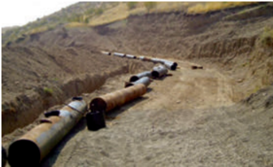
Tufenkian Foundation-sponsored construction of water supply system in the occupied Lachyn district

The funding for the agricultural programmes were channelled in particular through the “Fund for Rural and Agricultural Support of the NKR”, operating since 2008, and the “Artsakh Investment Fund”. In 2010-2013, “ARI” implemented investment programmes aimed at the development of agriculture in the occupied Kalbajar, Lachyn, Gubadly and Zangilan districts. For three years, some $2 million have been allocated in the agricultural sphere. Wheat and barley were sowed on about 550 hectares of land, and the livestock increased by 1800. 401 The Cafesjian Family Foundation has been financing projects in the occupied territories, including the construction of the “North-South” highway. 402