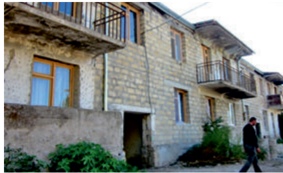
Tufenkian Foundation funds construction of apartments for Syrian Armenians in the occupied Zangilan and Lachyn districts 13 October 2012

Armenia is using incentive tricks, like granting to new and existing settlements the geographic names with clear historical connotation (such as “New Cilicia”, “Van” etc.), in an effort to draw historical parallels and encourage more Armenians to move to the occupied territories out of patriotic fillings or “historical grievances”. For example, in May 2013,