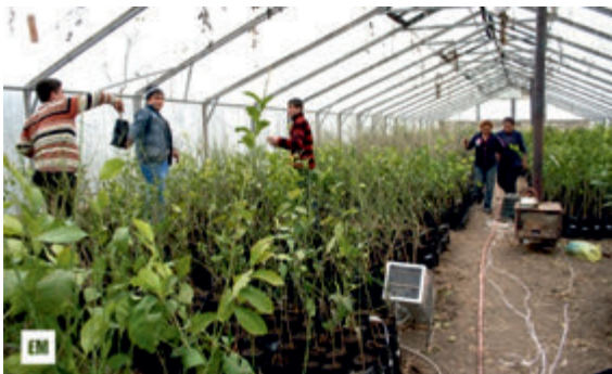
Syrian Armenians plant citrus in a greenhouse in the occupied territories of Azerbaijan | 2013

The Government of Armenia also allocates preferential loans (up to 5 million drams at a 10 percent reduced interest rate for up to five years) to Syrian Armenian small and medium-sized business owners to finance small production facilities. 183 Syrian Armenians settled in Lachyn, Zangilan and elsewhere in the occupied territories are eligible for those loans, since no distinction is made between the programmes for Syrian Armenians remaining in Armenia and those resettling in the occupied territories. 184