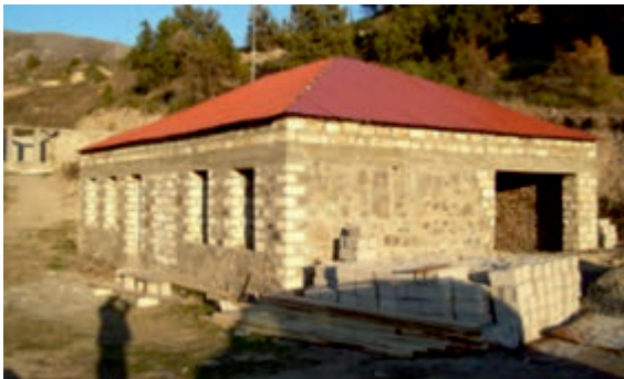
New house for a Syrian Armenian family is built in the occupied town of Lachyn | 02 September 2013