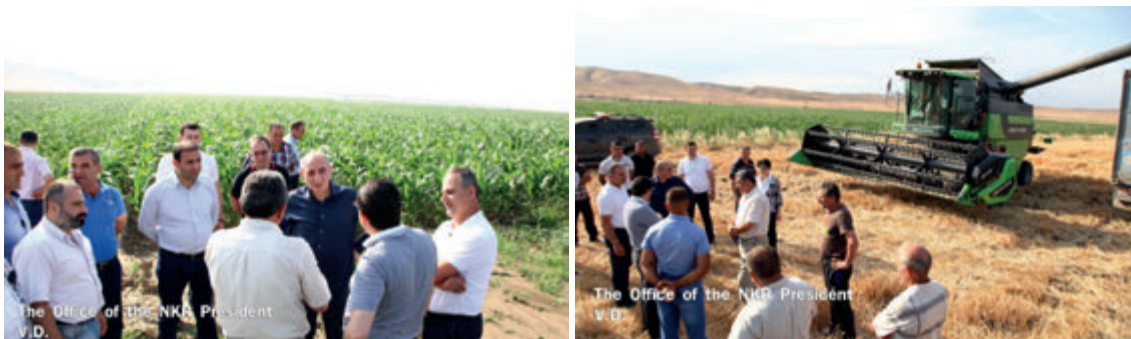
Bako Sahakyan visits agricultural fields near Talysh village in the occupied part of the Tartar district | | 27 June 2015

Minister of agriculture of Armenia, S.Karapetyan, is a frequent visitor in the occupied territories. In July 2012, he visited the breeding station of Khanabad village in the Khojaly district to inspect selection works as well as a new building of the veterinary laboratory. He discussed with the agents of the subordinate separatist regime issues related to agricultural development, including harvest works, using new technologies in agriculture as well as issues concerning further cooperation. 368 In November 2014, the delegation headed by Karapetyan visited the occupied territories again. The purpose of the visit was to discuss joint activities in the spheres of cattle-breeding and agricultural machines' maintenance. 369