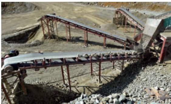
Ore extraction at Soyudlu gold mine in the occupied Kalbajar district

sulphide ores remaining at the Soyudlu deposit. As of April 2014, GPM Gold has been operating a new Albion gold extraction technology from Xstrata Technology (Australia) and supported by Core Process Engineering (Australia) 463 at the Ararat facility, which was designed to significantly increase the extraction coefficient for sulphide-heavy ores from Soyudlu mine. 464 Armenia exported a record 3.6 tons of gold dust in 2014 with a customs value of $82 million. The exports are in the form of doré (a semi-pure alloy of gold and silver usually created at the site of a mine). The alloy contains more than 70 percent gold. After further refinement, the gold is sold on the London stock exchange. Armenia's gold is exported to Canada. Eight kilograms of exports in 2014 went to Switzerland. To note, Canada first became interested in the region's gold deposits in 1997 when First Dynasty Mines, a Canadian company, purchased shares in the Ararat Gold Processing Plant. The plant was transformed into the Ararat Gold Recovery Company. Indian billionaire Anil Agarwal bought the company in 2002 and sold it to GPM Gold in 2007. 465 A 2012 estimate predicted that with such an extraction rate, the Soyudlu reserve will be exhausted in 15 years. 466