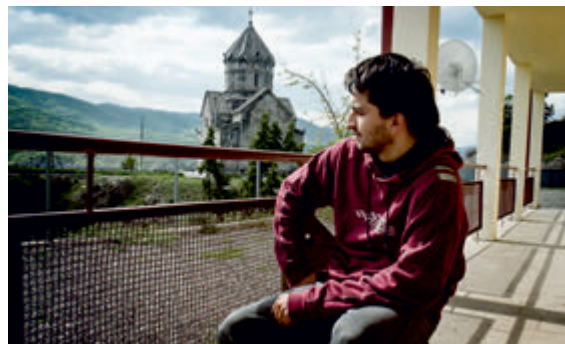
A Syrian Armenian from Qamishli region of Syria settled in the occupied town of Lachyn Photo by Gianmarco Maraviglia | Echo Photo Agency www.washingtonpost.com | 25 September 2014

Armenia continues the development of permanent energy, agriculture, social, residential and transport infrastructure in the occupied territories, including construction of irrigation networks, water supply systems, roads, electrical transmission lines and other economic and social infrastructure. Armenia’s direct involvement in building infrastructure in those territories, including the areas depopulated of their Azerbaijani population, is evident from provision of loans to the separatist regime 188 and supply of construction materials and heavy equipment. In 2014 alone, more than 20 billion drams were allocated for the implementation of