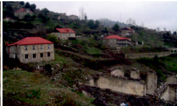
Newly constructed/rebuilt houses in the occupied town of Lachyn