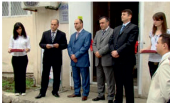
Armenia's Ardashinvestbank opens its branch in the occupied town of Shusha

So-called “minister of industrial infrastructures” of the subordinate separatist regime, Hakob Ghahramanyan, admitted that the regime has no independent monetary policy and is dependent on the bank system and credit policy of Armenia. 52 The national currency of Armenia (the dram) is illegally used in the occupied territories of Azerbaijan. According to the Central Bank of Armenia (CBA), the occupied territories are “part of the economic territory of Armenia, because the dram is the legal tender there and all banking institutions operating in Karabagh are licensed and supervised by the CBA”. 53