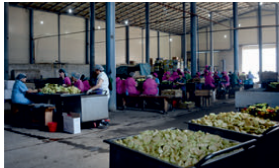
“Artsakh Fruit CJSC” production facility in the occupied territories | 27 August 2014