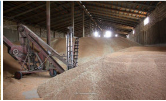
Wheat and other crops harvested in the occupied territories are transported to Armenia

Most of the crops, wheat, barley and corn harvested in the occupied territories are transported to Armenia for domestic consumption and possibly for re-export. 407 According to Arthur Aghabekyan, so-called “deputy prime minister” of the separatist regime, in 2012 alone, some 20,000 tons of grain were transported to Armenia. 408 He also informed that the Armenians from Khankandi “obtained” land in the occupied Aghdam district and were cultivating it.