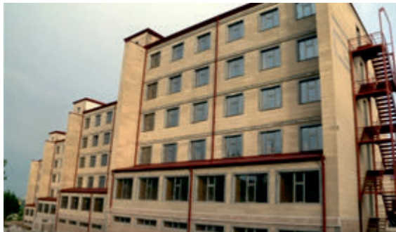
Newly constructed building of the Armenia's National Agrarian University branch in the occupied town of Shusha | 02 June 2015

Armenia's National Agrarian University opened its branch in Khankandi and later relocated to Shusha, 250 where it trains specialists for agrarian sphere, including in agronomy, animal husbandry, hydro melioration, land management, foodstuff technologies, etc. 251 On 29 October 2015, the Government of Armenia adopted a decree to establish a production-and-training facility of this university on the banks of the Araz River in the occupied territories and allocated 73.2 million drams for this purposes. As the Minister of Education and Science of Armenia, Armen Ashotyan, said, "it is for the first time that we launch construction of such a facility in Karabakh, which will help Armenian students to acquire knowledge." 252