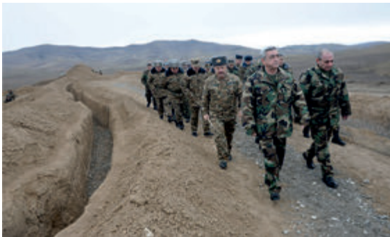
President of Armenia inspects the front line in the occupied territories | Photo from www.president.am | 03 January 2012

The movement of personnel in political and military leadership echelons between Armenia and the subordinate separatist regime and reshuffling of military commanders of Armenia with the warlords of the separatist regime is another striking evidence of their integration. The most recent example is the rotation between the Deputy Chief of General Staff of the armed forces of Armenia, Levon Mnatsakanyan, and the so-called “minister of defence” of the separatist regime, Movses Akopyan, officially approved by the decree of President Serzh Sargsyan of Armenia, dated 15 June 2015. 29