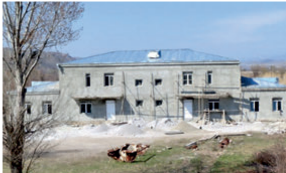
Construction of a ten-apartment building for the Syrian Armenian settlers in Khanlyg village of the occupied Gubadly district | Photo by Alvard Grigoryan | www.kavkaz-uzel.ru | 25 March 2014

Special social programmes, mainly in the form of one-time financial assistance for the first, second and more children (a family reportedly receives around $234 for the first child, $484 for the second, $1217 for the third and $1732 for the fourth. Families with six children under the age of 18 are provided with a house), are designed to stimulate birth-rate among the settlers in the occupied territories and indicate the existence of policy-driven repopulation efforts. 151 The birth rate rise, particularly in the occupied Lachyn, Gubadly and Zangilan districts, may also indirectly point to the increase in the number of settlers. According to the Armenian statistical data, only in 2014, some 946 settlers in total arrived to the occupied territories. 152 The declared target in resettlement is to increase the population of some villages in the so-called “Kashatagh”, “Hadrut” and “Shahumyan” “regions” minimum to 1,000 each by 2017. 153