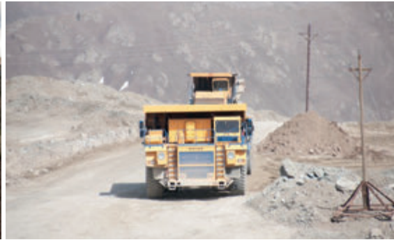
Trucks loaded with ore from Soyudlu gold mine in the occupied Kalbajar district are transported to Armenia for further processing and export

500 km-long road passing through the occupied Lachyn district 476 , which was reconstructed in 1997 with the financial assistance of Armenian diaspora, particularly that of U.S.-Armenian businessman Kirk Kerkorian through his Lincy Foundation. 477 It is expected that once the highway is completed, millions of tons of ore will be transported via that much shorter road, with only 116 km from the mining areas to the Sotk train station near the town of Vardenis in Armenia. 478 From Vardenis the ore will be transported by train to the Alaverdi Copper Smelter, also in Armenia, for further processing to export to third countries. 479 The highway's ongoing construction is partially funded by the Vallex Group CJSC, the primary beneficiary of the mining activities in the occupied territories.