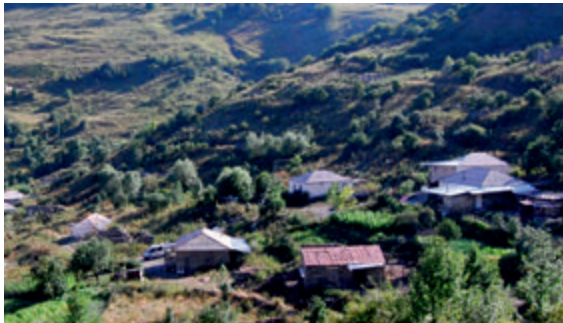
Armenian settlers in the Seyidlar village in the occupied Kalbajar district | Photo by Daniel Yan | www.flickr.com | 11 August 2015

Resettlement in the so-called “Kashatagh” (the occupied Lachyn, Gubadly and Zangilan districts) and “Shahumyan” 138 “regions” (the occupied Kalbajar district) is of particular importance to Armenia due to their “strategic value” 139 and economic attractiveness, including water resources, minerals, energy potential and ample agricultural opportunities. 140 A special “Kashatagh resettlement department” has been established to that end. As a result of the settlement policy, the number of settlers in the occupied town of Kalbajar has increased by 40 percent over seven years (2005-2012). 141 According to the so-called “governor” of the so-called “Kashatagh region”, Souren Khachatryan, in 2010-2013 alone, the number of settlers in region increased from 8,000 to 10,000. 142 While confirming the existence of a resettlement policy, he also admitted that the lack of adequate housing conditions affects the number of settlers that they can accommodate. It clearly shows the intention to settle more Armenians in the occupied territories in much shorter timeframe and that the lack of adequate accommodation facilities, including water shortage, apparently hinder the pace and the overall process of resettlement. 143