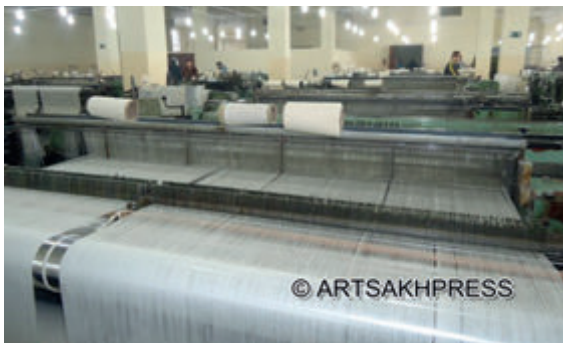
Sanderk LLC textile company production facility in the occupied territories

Many production facilities in the occupied territories process their materials at least partially in Armenia. For example, Sanderk LLC textile company (with the capacity of some 10 tons of