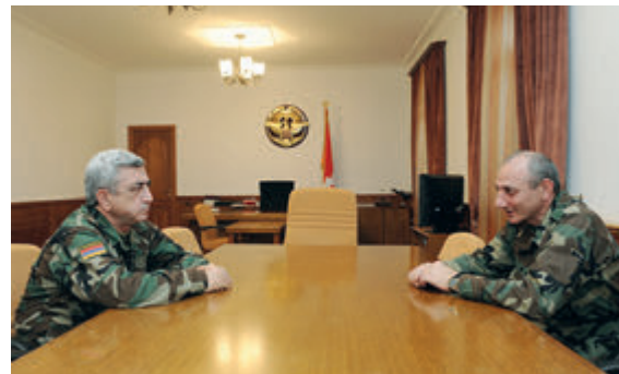
The close, almost umbilical, links between the subordinate separatist regime and Armenia have a strong personal element at the highest level. Above, President of Armenia meets with Bako Sahakyan | 24 October 2012

The examined evidence reveals that the exploitation of mineral and other economic wealth in the occupied territories is turned into a lucrative business and is the major source of income for Armenia and its subordinate separatist regime in the occupied territories. 490 The most frequently used term by the Armenian observers to describe the system of exploitation of the wealth in the occupied territories, which serves the oligarchs-owned businesses and represents the fusion of political power and economics, is “Bakonomics”, highlighting the role of Bako Sahakyan, who was left “in charge” by Serzh Sargsyan to manage the financial and economic flows out of occupied territories. 491