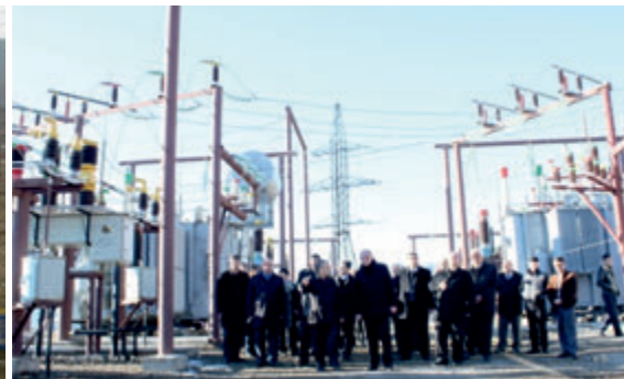
Newly built transformer substation in the vicinities of the occupied town of Shusha