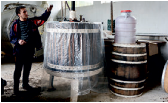
"Kataro" wine production facility in Tugh village of the occupied Khojavand district | 21 May 2014