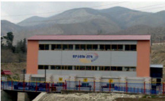
"Matagis-1" hydro-power plant in the occupied territories

In April 2008, China's Guangdong Dabu Water & Electricity Equipment Factory and Guangdzhou Karlson Trading Limited provided hydroelectric generators for "ArtsakhHEK OJSC" worth of $630,000. 400