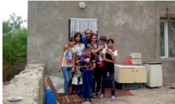
Armenian settlers in Gushchu village of the occupied Lachyn district | Photo by George T | @geoarmenia | 14 September 2015

and mechanical growth. 134 In 2001, a 10-year strategic plan was adopted aimed at resettling a total of 36,000 settlers. 135 As a result of the implementation of various resettlement programs in 1994-2004, some 7263 families (18,500 people) were transferred into the occupied territories. 136 By 2011, some 25,000-30,000 people were reportedly settled in those territories. 137