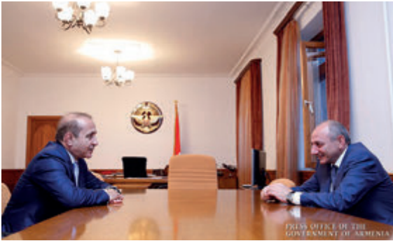
Prime Minister of Armenia Hovik Abrahamyan is a frequent visitor to the occupied territories | Photo from www.gov.am | 25 June 2014