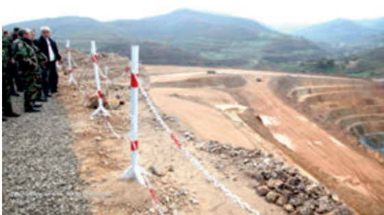
President of Armenia Serzh Sargsyan visits Demirli mine in the occupied part of the Tartar district | 13 November 2013

“We already know that Nagorno-Karabakh has enough coal for us to restart the old unit of the Yerevan Thermal Power Plant. Two years ago we launched a new unit and suspended the old inefficient one. But later the President instructed us to consider ways to restart the unit and to make it efficient. So, we decided to use the coal from Magavuz.” 486