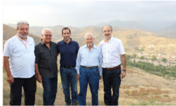
Shareholders of the Lebanon-based “ARI” company are visiting the occupied Lachyn district, where they fund construction of a new Armenian settlement | Photo from www.arirroots.com | 16 October 2014

Telecom CJSC” – telecommunication; “Ata-Vank-Les CO” (USA) – parquet tile production; “Sirkap Armenia CO” (Switzerland) – hotel business and construction material production; “Haik Watch And Jewellery CO” (Switzerland) – jewellery production; “Arvard CO” (USA) – dairy production; “Shishmanian Ltd.” (Monaco) – food processing, pasta production; “Andranik Shpon” CO (Switzerland) – wood processing; “Mika Ltd.” (U.K.) – wine making; “Australia Nairi Ltd.” (Australia) – hotel business; “Yerkir Tour CO” (USA) – hotel business; “Sasun CO” (Iran) – polyethylene pipe production; “Minasian CO” (USA) – carpet production; “Artsakh Gorg Ltd.” (USA) – carpet production. 266