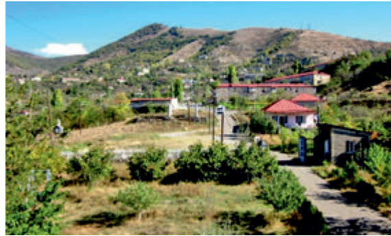
Newly built/or renovated houses in the occupied town of Lachyn 13 October 2012

cotton fabric of 5 types, produced per month) carries out dyeing process of its production in Gyumri (Armenia) and transports the material back to the occupied territories for further processing. Raw material for textile production is supplied from the Central Asia and elsewhere. Based on the agreements with several companies in Yerevan, a substantial part of the products is sold in Armenia. In order to enter foreign markets, the company tries to improve fabric dyeing process. For this purpose, two specialists of the company were sent to China to study the experience of enterprises engaged in textile production. As a result, a preliminary agreement with Chinese specialists was reportedly reached to purchase and install dyeing equipment in the factory. Two employees of the company are currently studying at the Moscow Textile Institute (Russia). 249