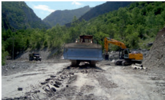
Construction of the Vardenis-Aghdara highway passing through the occupied Kalbajar district | Photo from www.himnadram.org | 2014

Transport infrastructure projects carried out in the occupied territories include in particular a network of roads designed exclusively for connecting Armenia and the occupied territories and Armenian settlements within the occupied territories. Among them are the Goris-Khankandi road, passing through the occupied Lachyn district, linking Armenia and the occupied territories, the “North-South” highway, connecting the northern part of the occupied territories with the South and the 116 km-long Vardenis-Aghdara highway, passing from Armenia through the occupied Kalbajar district of Azerbaijan. A stretch of road linking