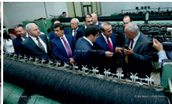
Prime Minister of Armenia Hovik Abrahamyan visits “Metax” company in the occupied territories

03 March 2015