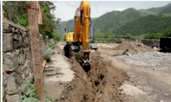
Hayastan All Armenian Fund – Argentina branch funded the construction of the water supply system in the occupied town of Kalbajar | Photo from www.himnadram.org | August 2013