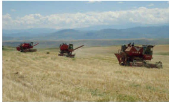
Crop harvesting in the occupied territories