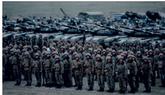
President of Armenia Serzh Sargsyan attending the military exercises of Armenia’s armed forces in the occupied territories of Azerbaijan | Photo from www.president.am | 14 November 2014