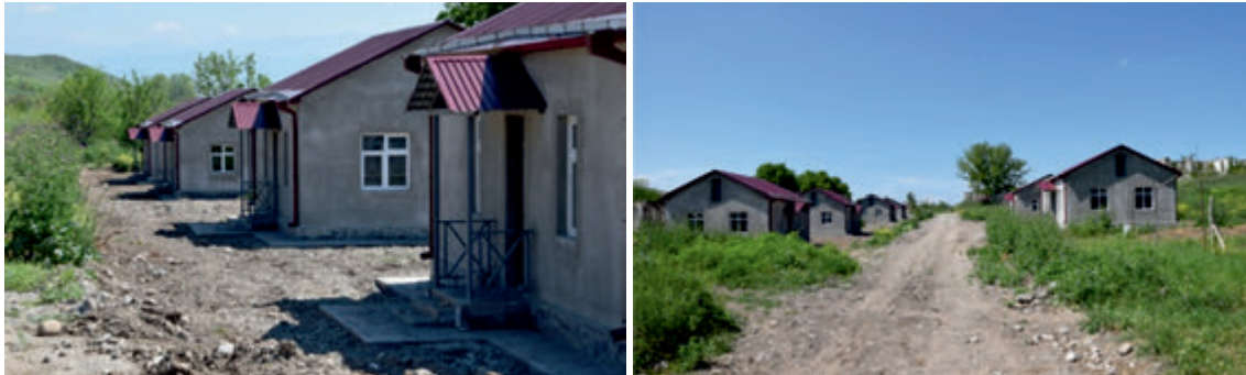
Newly built houses for the Armenian settlers in the Khanlyg village in the occupied Gubadly district of Azerbaijan | Photo from www.nkrlottery.am | 2014

the separatist regime Arthur Aghabekyan is quoted to have said that “[t]he implementation of the repatriation program of the Araks River coast will open new working places” and “[t]he Government intends to prepare 10,000 hectares of land for farming”. He further added that 400 hectares of land was exploited in 2013 and 1000 hectares would be allocated to the farmers in 2014. 157