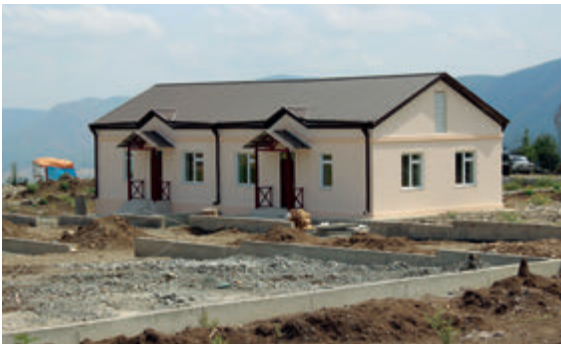
“ARI” Company funded construction of “New Cilicia” settlement in the occupied territories