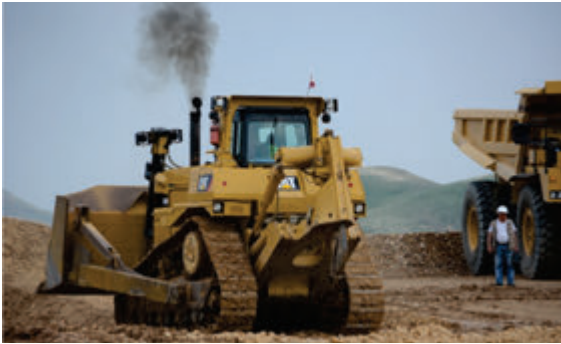
Caterpillar heavy machines are used in the exploitation of Demirli copper-molybdenum mine | Photo from www.bm.vallexgroup.am | 27 May 2014