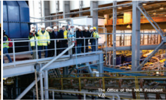
Commissioning of the ore processing plant at Demirli copper-molybdenum mine | Photo from www.artsakhpress.am | 26 December 2015

a factory was built nearby to process ore with annual capacity of up to 1,8 million tons, and in the near future it is planned to be expanded to process some 3,5 million tons of ore. 439 Mining and Metallurgy Institute CJSC of Armenia with the cooperation of Strathcona Mineral Services Ltd. (Canada) was involved in drawing up the first stage of mine evaluation and exploitation plan in 2012, which envisages extraction of 1.1 million tons of ore by 2016. 440