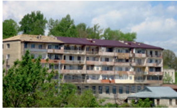
Residential buildings in the occupied town of Shusha are renovated for the Armenian settlers | September 2010

model is based on attracting foreign shareholders to come to contractual relations with it and lend money for the fixed interest-rate. “ARI” gives those funds to local organizations accredited by the subordinate separatist regime at an increased rate. The organizations in their turn allocate financial resources to the borrowers, usually to the settlers, to fund their economic enterprises with subsidized interest-rate. The whole credit process of “ARI” is allegedly “guaranteed” by the subordinate separatist regime, to present the investments as “risk-free”. 259 According to the so-called “prime minister” of the subordinate separatist regime Ara Arutyunyan, thanks to “ARI”, hundreds of families in the “Kashatakh” and “Shaumyan” “regions” used those credits and solved their social problems. 260 In 2011-2014, “ARI 2 Ltd.” and “ARI 3 Ltd.” entities, registered in Cyprus 261 were established to fund resettlement efforts in the so-called “Kashatagh region”. 262