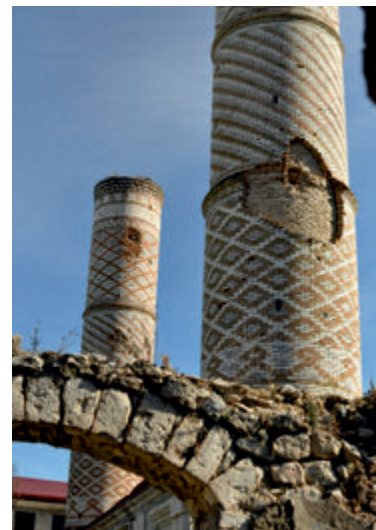
Ruins of Yukhary Govhar Agha Mosque in the occupied town of Shusha

Architectural monuments of national importance in those territories include the sixth century Albanian Aghoghlan cloister and the fourteenth century Malik Ajdar tomb in Lachyn, the fourth century Albanian Amaras cloister and a considerable number of Albanian temples in Khojavand, the eighteenth century Asgaran castle, fourteenth century tombs and a number of Albanian temples dating back to the Middle Ages in Khojaly, the sixth century Albanian Saint Jacob and thirteenth century Albanian Khatiravang cloisters and the thirteenth-fourteenth centuries Lekh castle in Kalbajar, the Albanian cloister of the fifth to eighth centuries in Gazakh, the thirteenth-fourteenth