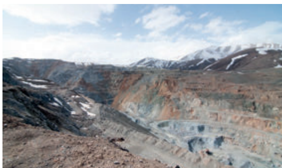
Exploitation of Soyudlu gold mine in the occupied Kalbajar district