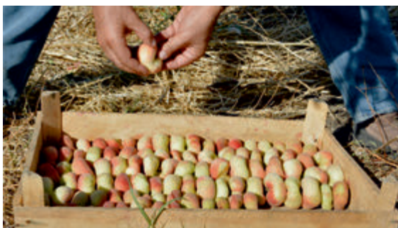
Settlement produce grown by Syrian Armenians in the occupied territories | 04 August 2015

The Armenian Technology Group Inc. (ATG), operating in Armenia, made its "Seed Multiplication Project" available to the settlement farming in the occupied territories. Some 24 settlements in the occupied territories benefited from ATG's seeds program. 372