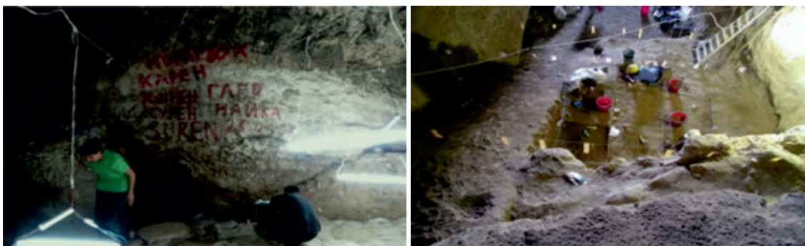
Excavations in the Azykh cave in the occupied Khojavand district (right) and vandalized interior of the cave (left) | Photo by Alvard Grigoryan | www.kavkaz-uzel.ru | 04 August 2013

Acts of barbarism are accompanied by different methods of defacing the Azerbaijani cultural image of the occupied territories. Among them are large-scale construction works therein, such as, for example, the building of an Armenian church in the town of Lachyn.