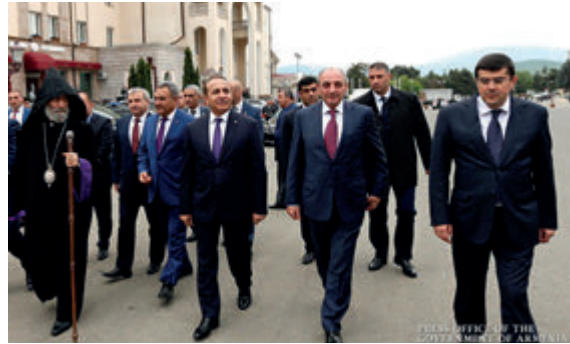
Prime Minister of Armenia Hovik Abrahamyan visits the occupied town of Shusha | 08 May 2015

In November 2013, the President of Armenia S.Sargsyan visited the “southern part of the Hadrut region” (occupied Jabrayil district) and inspected the usage of farmlands in that section of the Araz Valley and the implementation of agricultural programmes there. 361 During the consultation with the agents of the subordinate separatist regime, S.Sargsyan reportedly stressed the importance of the proper implementation of the planned activities, noting that it would substantially contribute to the development of agriculture there. 362