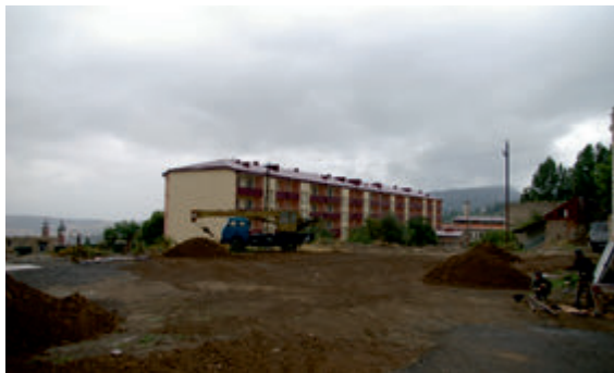
Construction/Reconstruction of a residential building in the occupied town of Shusha 07 August 2011

According to the contracts signed with Armenian settlers, they are granted “legal ownership” of the donated properties at no cost, on condition that they live there for more than 10 years. 131 Over the past three years, some 3 billion Armenian drams were allocated to provide the settlers with construction materials. In 2015 alone, some 350 million drams were allocated for those purposes. 132 Investment in construction of new houses for the settlers is yet another proof of the hastily carried settlement policy.