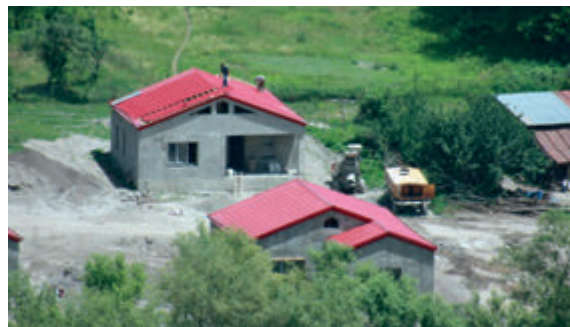
Construction of a newly housing in the occupied Lachyn district, funded by “ARI” Company

In 2009, Armenbrok OJSC, a specialized investment company on Armenia’s capital market, placed 861,652 common registered equities of “ArtsakhHEK OJSC” for a total of 904.6 million drams, thus completing the initial public offering (IPO) for “ArtsakhHEK OJSC”. 1023 investors participated in the placement, including individuals and legal entities from Armenia, the USA, Switzerland, France, Slovakia, Australia, Russia, Iran, and the UAE. 271