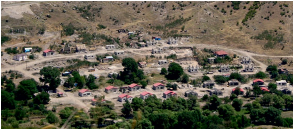
Construction of a new settlement in the occupied Lachyn district