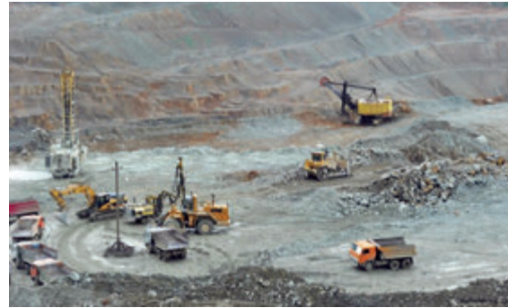
Exploitation of Soyudlu gold mine in the occupied Kalbajar district

270 tons 460 ). Extracted unprocessed ore is transported for processing to Armenia by rail at a crushing and screening plant and then to Ararat Gold Processing Plant. The company exports 99 percent of Armenia's total gold exports. 461 In 2013, the company was ranked as the number one taxpayer (7.261 billion AMD) in Armenia. Since 2007, GeoProMining has invested some $260 million into GPM Gold and Agarak Copper-Molybdenum Mine Complex. 462 The money was used to upgrade the extraction technology at the Ararat plant, which was not designed to process the