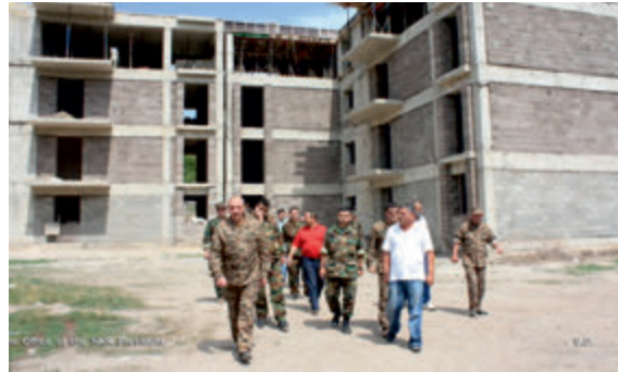
Construction of a new residential building in the occupied town of Kalbajar

In 2003, the “Menq Union For Farmers Mutual AID” was set up to support the so-called “Kashatagh” settlers in establishing households. Within its seven years of operation, the Union has supported the establishment of more than 50 households. Through livestock breeding projects, it has provided over 100 heads of cattle, 70 calves and bulls, and 50 pigs. The Union has also provided poultry and horses. 129 Livestock for such projects is generally provided from Armenia. 130