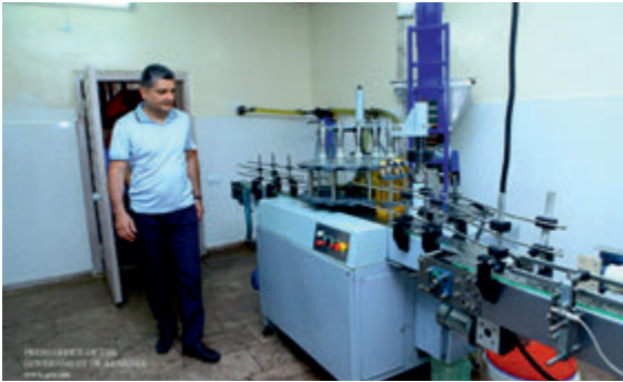
Former Prime Minister Tigran Sargsyan of Armenia visiting vegetable oil factory in Gyrmzy Bazar village in the occupied Khojavand district | Photo from www.gov.am | 03 September 2013