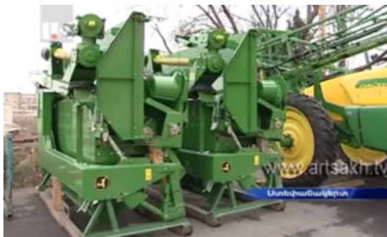
US-manufactured John Deere agricultural equipment used in the occupied territories

In 2013, Germany’s Deutz Fahr company provided some 30 combines and other agricultural machines to the entities operating in the occupied territories. 237 “The Small and Medium Entrepreneurship Development National Centre of Armenia Fund” (SME DNC of Armenia) provides Belarus-manufactured tractors to the enterprises engaged in agriculture in the occupied territories. 238 In 2013, some 20 farm tractors were provided to the occupied territories and stored in the “Support Fund of Village and Agriculture of the NKR”’s equipment storing facility in the occupied town of Shusha. 239 In 2014, an agreement was reached to provide additional 40 tractors of the kind. 240 That equipment is distributed among settlers throughout the occupied territories according to the schedules. 241