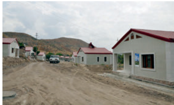
Newly established “Ariavan” settlement in the occupied Lachyn district, funded by Armenian diaspora from Lebanon through the “Artsakh Roots Investment Ltd.” | 2014

The subordinate separatist regime in absolute terms is receiving increasing external support. Armenia provides more than half of “budgetary” spending of the subordinate separatist regime through loans and grants from its State budget. That financial support, which amounts to a State policy, is critical in subsidizing settlements and sponsoring illegal economic activities in the occupied territories.