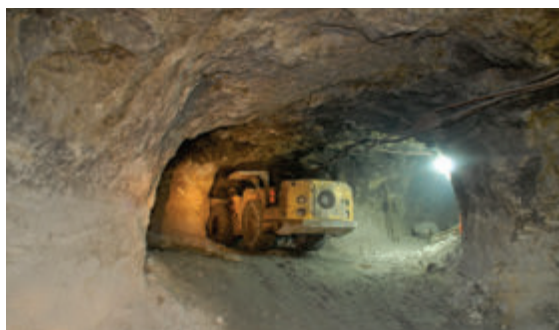
Sweden's Atlas Copco Wagner underground mine truck of Armenia's Vallex Group is seen working in the underground Gyzybulag gold and copper mine near Heyvaly village in the occupied Kalbajar district

The occupied territories are also rich in different types of building materials, including face stone, block stone, different types of construction stones, loam, sang-gravel chromite, lime, marble and agate. There are lime and clays deposits in Chobandag, Shahbulag, Boyahmedi (Aghdam); marble deposits in Harovdad and Shorbulag; tuff deposits in Kilseli (Kalbajar); pearlite deposits in Kechaldag (Kalbajar) etc. 415 Furthermore, there are more than 120 mineral water deposits. Among them are Yukhary (Upper) and Ashahy (Lower) Istisu, Bagysag and Keshdak in the Kalbajar district; Iligsu and Minkend in the Lachyn district; Turshsu and Sirlan in the Shusha district.