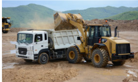
Heavy machinery of Armenia's Vallex Group is used for exploitation of natural resources in the occupied territories of Azerbaijan | | 27 May 2014

The evidence shows that Armenia exercises pervasive control of the entire economic and commercial system in the occupied territories, including over inbound and outbound trade flows and economic resources. Armenian companies and businesses registered in Armenia or their affiliates and entities established in the occupied territories with financial and other support of Armenia control the entire market and manage the export of settlement produce to Armenia and to international markets. Armenian private businesses play a major role in Armenia's colonial enterprise in the occupied territories. Many Armenian companies operate farms, orchards and production facilities in those territories. Raw materials and technology are provided to the occupied territories from Armenia and from other countries through Armenia.