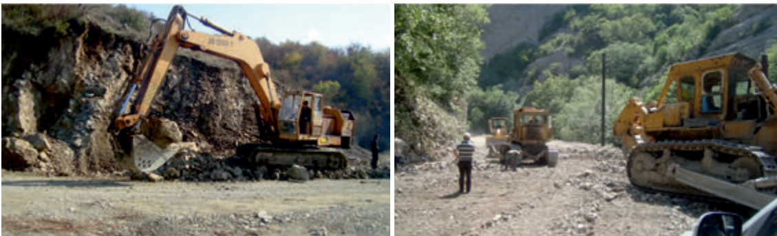
Construction of the Vardenis-Aghdara highway passing through the occupied Kalbajar district of Azerbaijan | Photo from www.himnadram.org | 2014

telethon. 193 Bako Sahakyan pointed to the strategic, political and socio-economic significance of the road. 194 The road, which will be shorter by 150 kilometres than the road via the occupied Lachyn district and which will cut travel time from Yerevan (Armenia) to the occupied territories from 6 to about 3 hours, 195 will be reportedly used for movement of goods and minerals in and out of the occupied territories to the markets in Armenia and other countries and will improve geographic access for colonization of those territories. 196 Armenia's companies like the Vallex Group CJSC and its subsidiary Base Metals CJSC, involved in pillaging of natural resources in the occupied territories, are the primary beneficiaries of that road (see below). 197 According to Alexander Kananyan, who is one of those resettled in the occupied town of Kalbajar, "the road bypasses all main villages and district's main town Karvachar [Kalbajar] by about 18 km. That's why the new road is being built primarily for freighting, rather than for the locals." 198 As the so-called "minister of urban planning" of the separatist regime Karen Shakhramanyan noted, the road "has strategic and economic importance, as it is convenient for freighting and realization of perspective programs in the mining sphere – Drmbon [Heyvaly] gold mining factory and Maghavuz [Chardagly] coal factory, which are both located in the Martakert region of Nagorno