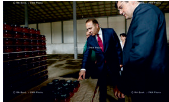
Armenia's Prime Minister Hovik Abrahamyan visits “Artsakh Fruit CJSC” company's facilities in the occupied territories | Photo from www.gov.am | 24 June 2014

The “Stepanakert Brandy Factory CJSC” operates wine factories in the occupied Khojavand district, Gyrgyzy Bazar village and the town of Khankandi. The factory produces fruit vodkas, mulberry and cornel, brandy and wine. To carry out the production process, the factory procures large amount of grape. Each year it increases the volume of procurement. The declared goal is to gradually increase brandy production to one million bottles annually. According to the company’s own data, in 2007 over 5200 tons of grapes were procured, in 2008 – 5800 tons and in 2009 – over 6200 tons. 303 The company has 212 hectares of vineyard. In the occupied territories, the factory procures 70–80 percent of grape harvest. The plant has the capacity to collect and process some 6,000 – 6,500 tons of grapes. 304 In 2014, the company collected 2,560 tons of grapes. 305 A considerable part of the procured grape harvest was directed to the production of wine.