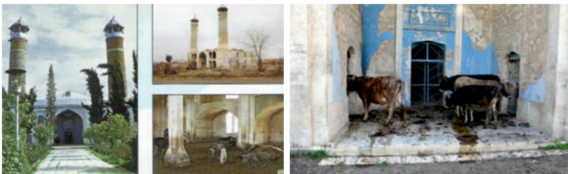
Juma Mosque in the occupied city of Aghdam was destroyed and turned into a barn

town in the Kalbajar district, mosques in the Zangilan, Gyrag Mushlan, Malatkeshin, Babayly and Ikinji Aghaly villages, medieval cemeteries in the Jahangirbayli, Babayly and Sharifan villages in the Zangilan district, ancient cemeteries in Gayaly and Mamar villages, the mosque in Mamar village in the Gubadly district, the mosque in Garygyshlag village and the ancient cemetery in Zabukh village in the Lachyn district, the mosque complex in Chalabilar village and the ancient cemetery in Khubyarly village in the Jabrayil district, mosques in Fuzuli town and the Gochahmadli, Merdmli and Garghabazar villages in the Fuzuli district, the cemeteries of the Khojavand, Akhullu, Kuropatkino, Dudukchu and Salakatin villages and the old cemetery of Tugh village in the Khojavand district, the ancient hammams in Umudlu village in the Tartar district and the cemetery of Karki village in the Sadarak district, have been destroyed, burnt down and pillaged.