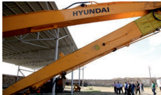
“Araks branch” of “Hadrot Agroecology CJSC” in the occupied Zangilan district | Photo from www.tert.am | 16 May 2013 |

In 2013, Tufenkian Foundation initiated greenhouse cultivation near Alibayli village in the occupied Zangilan district of Azerbaijan. With the co-sponsorship of the Armenian Community Council (ACC) of Great Britain, two greenhouses with a total area of 480m 2 were built. In 2014, some 1,873 kg of tomatoes were harvested. 344