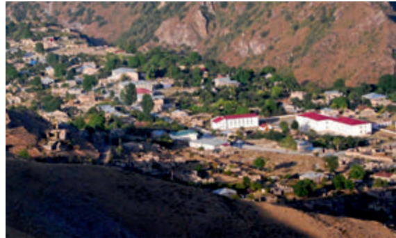
Newly constructed/renovated buildings in the town of Kalbajar in the occupied Kalbajar district | Photo by Daniel Yan | www.flickr.com | 14 August 2015

Thus said, according to the Armenian statistical data for 2010-2015, the largest population increase was registered in the so-called “Kashatagh”, “Shushi”, “Shahumyan” and “Hadrut” “regions”, with 19.2, 6, 3.3 and 9.7 percent growth respectively. 149 In 2014, the number of births in “Kashatagh region” was reportedly registered at 222, an increase in comparison with 2013 (186). In Khankandi the growth was 1076 (compare with 974 in 2013). 150