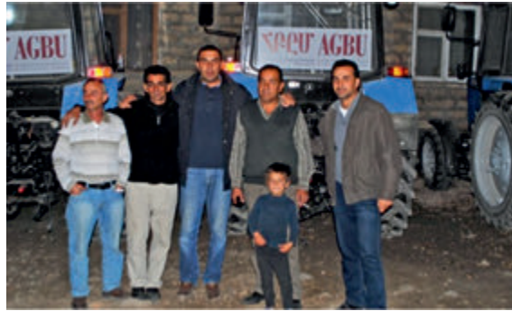
A Syrian Armenian family settled in the occupied town of Zangilan stands in front of tractors donated to them by AGBU and Cherkian Family Foundation | 16 January 2014

in Armenia lack sufficient financial resources themselves, 244 it relies on Armenian diaspora that make donations through charitable organizations or individual contributions. 245 Thus, in 2012, “Artsakhbank CJSC” realized its micro-credit program, worth of $320,000. The funding was provided by investors of Armenian origin from the USA and Canada. As of 2012, some 47 entities benefited from the programme. The bulk of the funding was directed at the implementation of agricultural programmes – veterinary medicine, sheep breeding, fish-breeding, non-perennial plants’ growing. Part of it was allocated to stimulate trade. The maximum amount of each credit was $15,000 or its equivalent in Armenian drams. 246