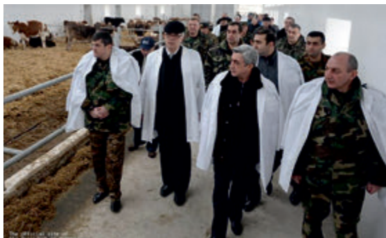
President of Armenia visits pedigree cattle husbandry farm in Khanabad village in the occupied Khojaly district 05 January 2012