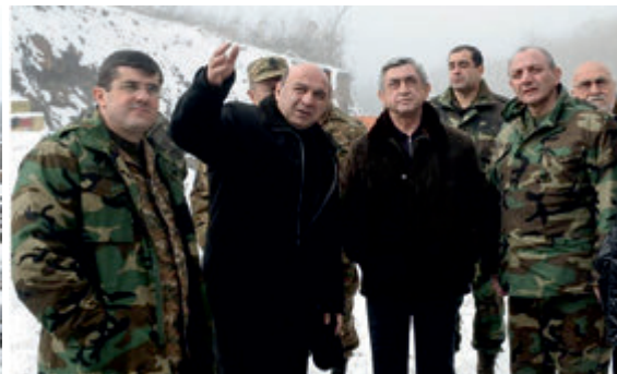
President of Armenia visits coal mine near Chardagly village in the occupied Tartar district | Photo from www.president.am | 05 January 2012