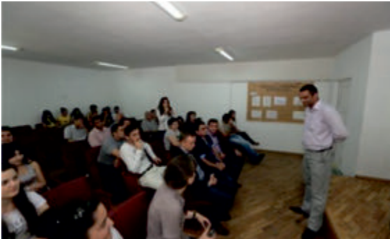
Orientation for the newly arrived Syrian Armenians settled in the occupied town of Lachyn | 27 May 2013