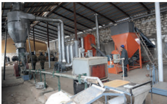
A wood processing and pellet producing enterprise in Chanagch village of the occupied Khojaly district | Photo from www.president.am | 03 January 2012

The wine factories of “Stepanakert Brandy Factory CJSC” in Gyrgyzy Bazar village and Khojavand district mainly provide the realization of grape procurement, production and ageing brandy alcohol by the company, and the wine factory in Khankandi deals mainly with bottling. All the bottling paraphernalia comes from Armenia. 306 For that purpose, a European conveyor with productivity of 2000 bottles per hour was installed in the factory. For the production of vodkas, the factory sources some of its fruits, in particular apricot and a bit of the cornel from Armenia. 307 The production of “Stepanakert Brandy Factory