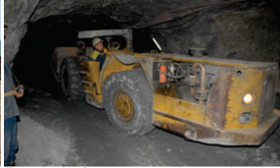
Exploitation of the Gyzybulag underground mine near Heyvaly village in the occupied Kalbajar district

processing 350,000 tons of ore annually, 428 producing some 20,000 tons of ore concentrates per annum or 1200 tons monthly. 429 According to Arthur Mkrtumyan, Director General of Base Metals CJSC and Vice-president of the Vallex Group, as of October 2013, out of 3,2 million tons of total reserves 3 million tons have been extracted. 430 Concentrate is transported to Armenia, where it is further processed by the Armenia-registered Armenian Copper Programme CJSC 431 into gold containing copper and exported to international markets, mainly in Europe. 432 Another Armenian source informs that the ore is refined only once and exported to Germany for further processing. 433 Mkrtumyan confirmed in 2013 that the mine had reserves for another two or two and a half years only. 434