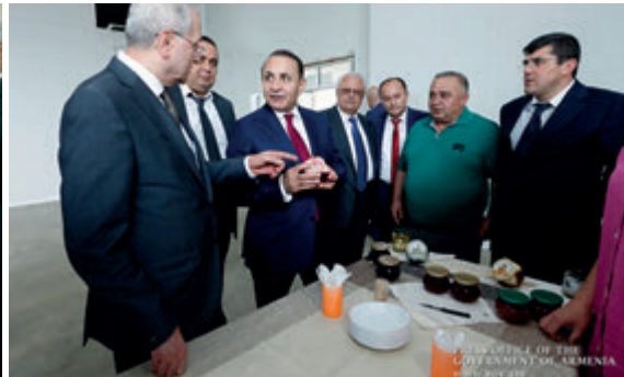
Prime Minister of Armenia Hovik Abrahamyan visits production facilities in the occupied territories | Photo from www.gov.am | 24 June 2014