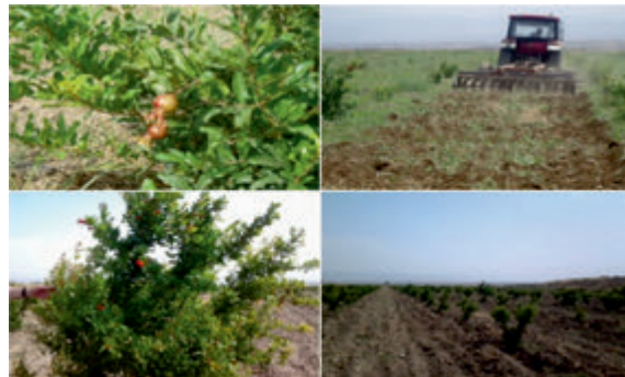
Pomegranate orchards near the “Arajamugh” settlement in the occupied Jabrayil district set up by Tufenkian Foundation

According to the Tufenkian Foundation, “[t]he liberated territories of Artsakh possess abundant, fertile land, ideal for cultivation of fruits and grains.” 336 In 2000, six hectares of land have been devoted to pomegranate cultivation near the “Arajamugh” settlement in the occupied Jabrayil district of Azerbaijan, managed by the Tufenkian Foundation. 337