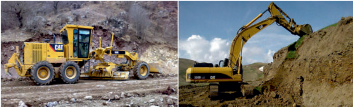
Armenia's Dorozhnik LLC company is involved in the construction of Sotk-Kalbajar road | | 2014